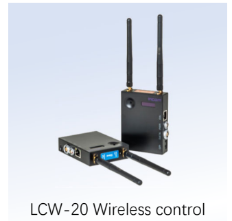
LCW-20 Wireless control