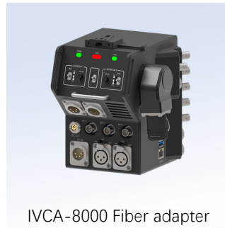
IVCA-8000 Fiber adapter