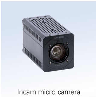
Incam micro camera